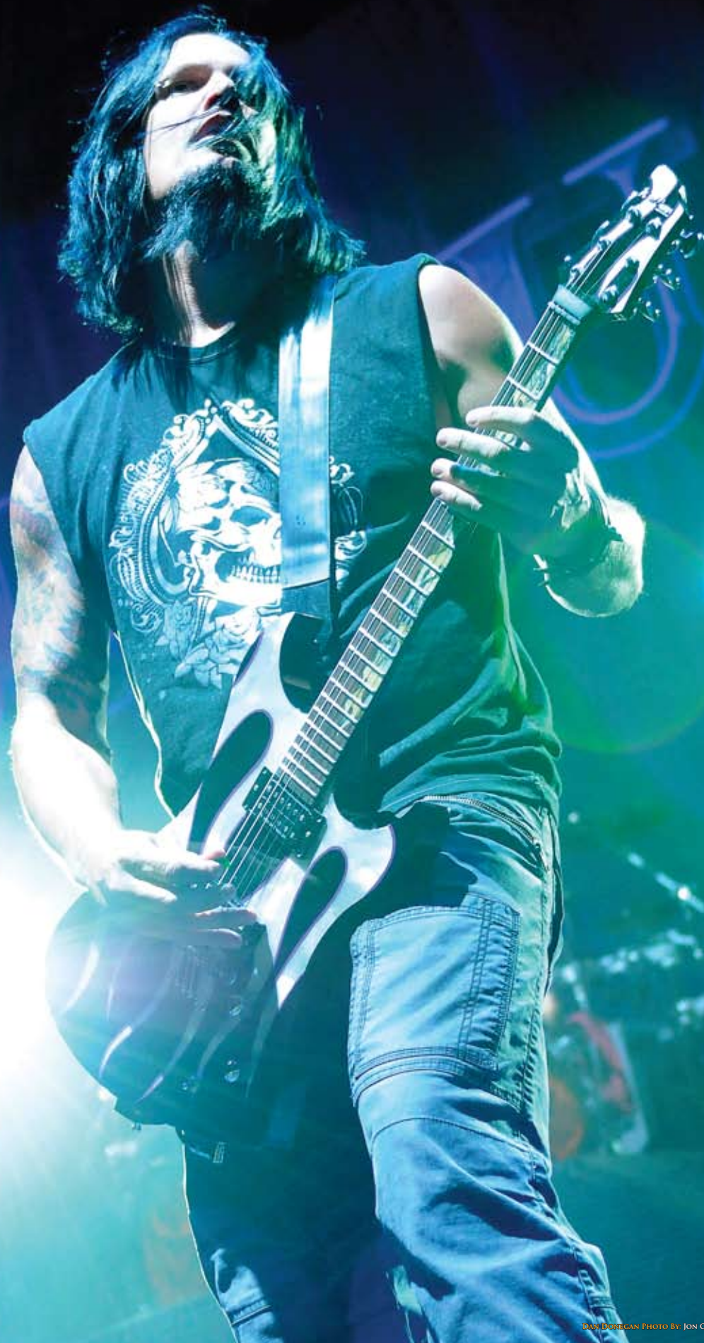
DAN DONEGAN

Washburn teamed up with Donegan to create a truly unique guitar, designed to appeal to players of all genres of music. All Donegan Series guitars exemplify Donegan's hardworking attitude to music because they are handcrafted with care by Washburn's hardworking craftsmen and come with premium hardware and electronics. See why the Donegan signature Washburn Maya is the guitar he credits for being the only guitar he played during the recording of Indestructible .