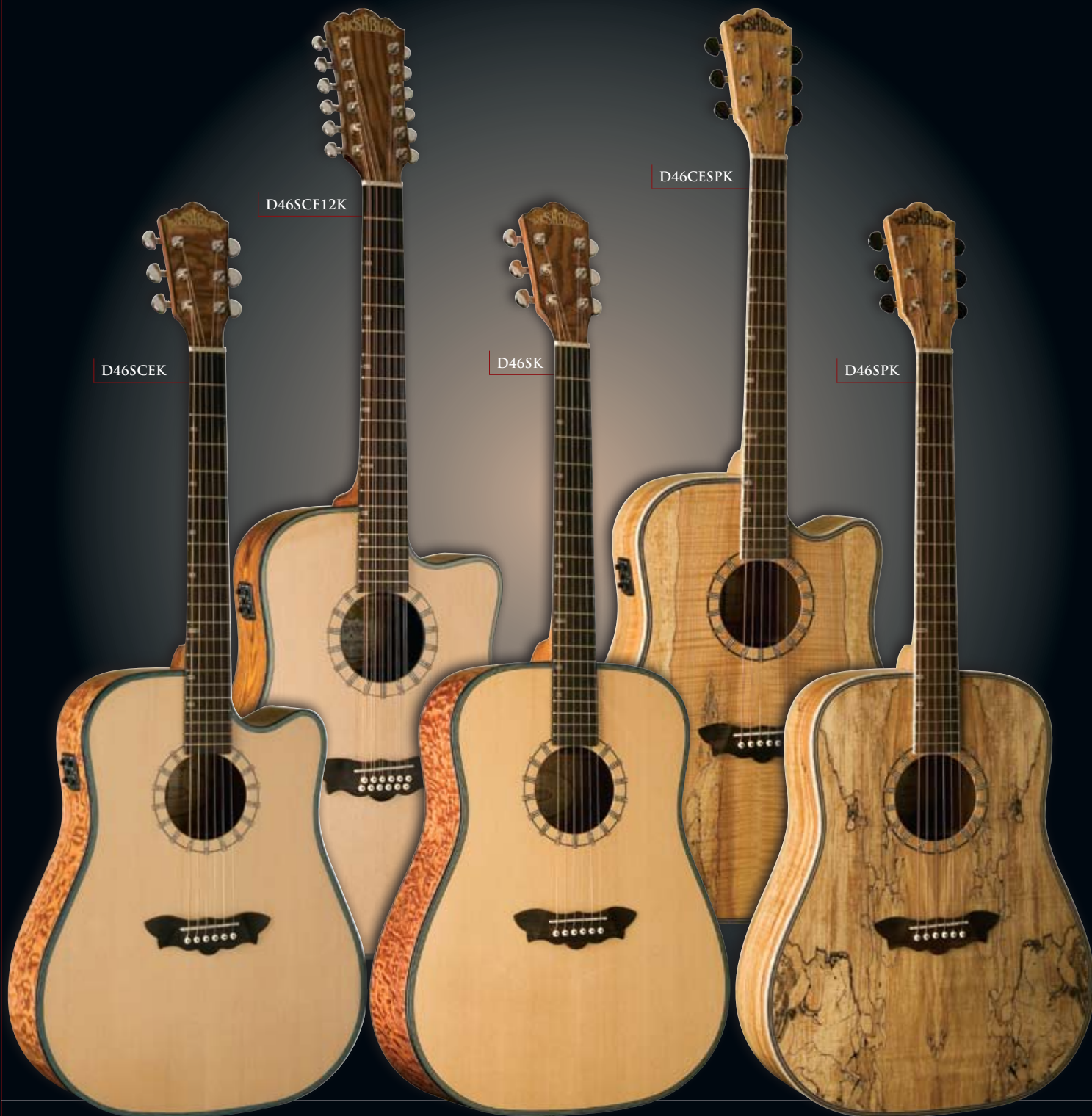
D46SCEK & D46SCE12K